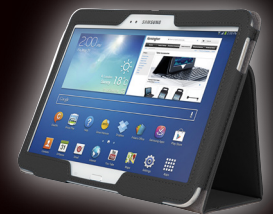
K97096WW Comercio Soft Folio Case & Stand for Galaxy Tab 3 & 4 10.1 - Black