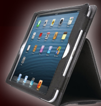
K97126WW Portafolio Soft Folio Case for iPad Mini 3/2/1 - Black