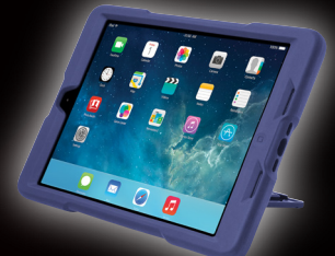
K97078WW Black Belt 2nd Degree Rugged Case for iPad Air - Plum

OFFER LIMIT: ONE REDEMPTION PER BOARD PURCHASE. MUST PURCHASE BETWEEN 1/1/15 - 12/31/15