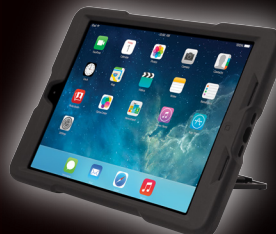
K97065WW Black Belt 2nd Degree Rugged Case for iPad Air - Black