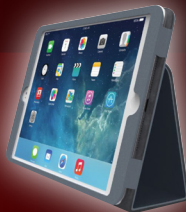
K97212WW Comercio Plus Soft Folio Case for iPad Air & iPad Air 2 - Slate Grey