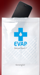
K39723AM EVAP Water Rescue Pouch