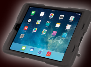
K97073 Black Belt 2nd Degree Rugged Case for iPad Mini - Black