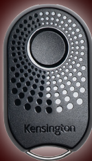
K97150 Proximo Smartphone and Key Locator