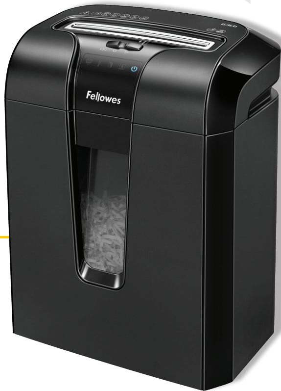
©2013 Fellowes, Inc.

Energy Efficient Optimal energy efficiency 100% of the time - in and out of use